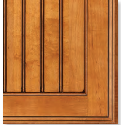
HAZELNUT BURNT SIENNA GLAZE AND HIGHLIGHT