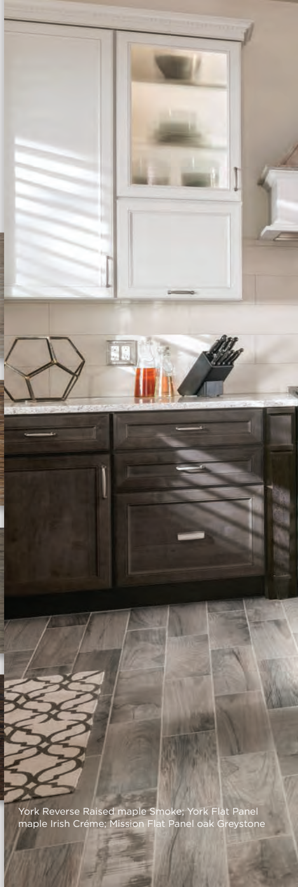
York Reverse Raised maple Smoke; York Flat Panel maple Irish Crème; Mission Flat Panel oak Greystone

Available in Gold on select door styles in oak and quartersawn oak.