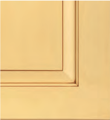
SAFFRON CLASSIC MOCHA GLAZE AND HIGHLIGHT