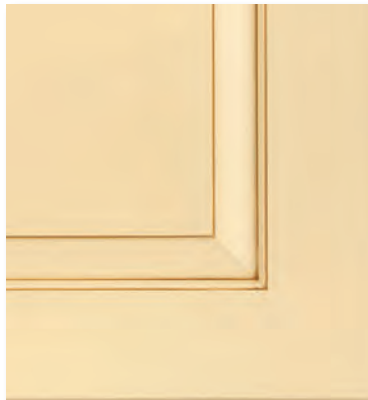
SAFFRON CLASSIC MOCHA HIGHLIGHT