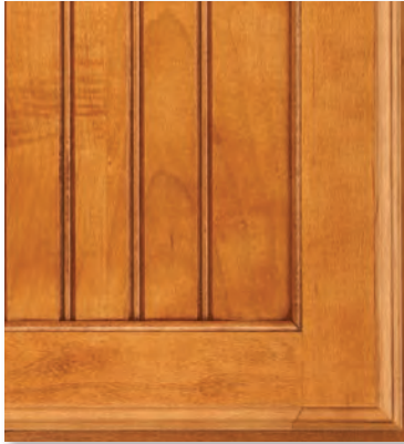
HAZELNUT BURNT SIENNA GLAZE ONLY