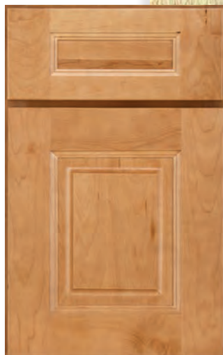
Providence Raised Panel maple Sandalwood

New colors inspired by the patinas in nature itself, Sandalwood and Tumbleweed are the ideal way to see how our finish suite can simplify, yet amplify, your design palette. Evolved from their popular predecessors, these simple classic colors bring warmth to any kitchen.