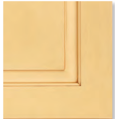
SAFFRON CLASSIC MOCHA GLAZE ONLY