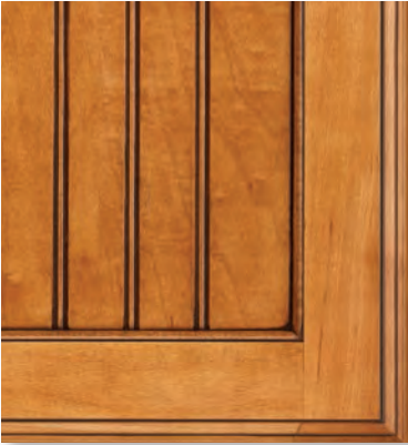
HAZELNUT BURNT SIENNA HIGHLIGHT