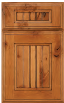
Calistoga Beaded Panel knotty alder Sandalwood Burnt Sienna Highlight