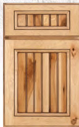
Wellington Beaded Panel rustic maple Tumbleweed Burnt Sienna Glaze and Highlight