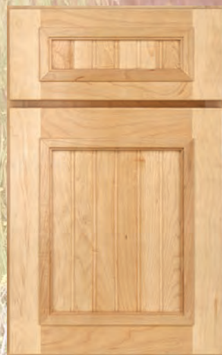
Winslow Beaded Panel maple Tumbleweed