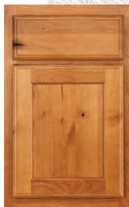
Briarwood Reverse Raised knotty alder Sandalwood