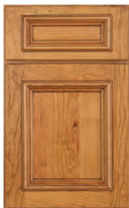
Camelot Reverse Raised cherry Tumbleweed Burnt Sienna Glaze and Highlight